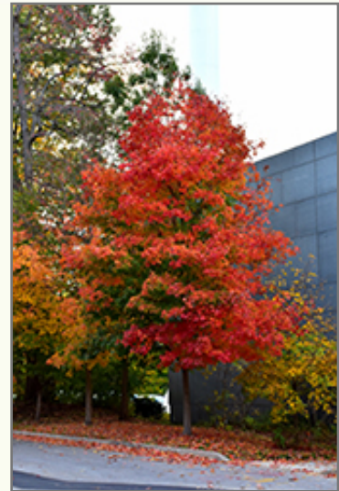
Fall Fiesta® Sugar Maple in fall

Fall Fiesta® Sugar Maple is recommended for the following landscape applications;