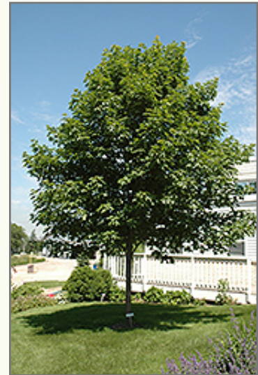
Fall Fiesta® Sugar Maple