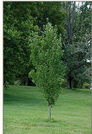
Presidential Gold Ginkgo