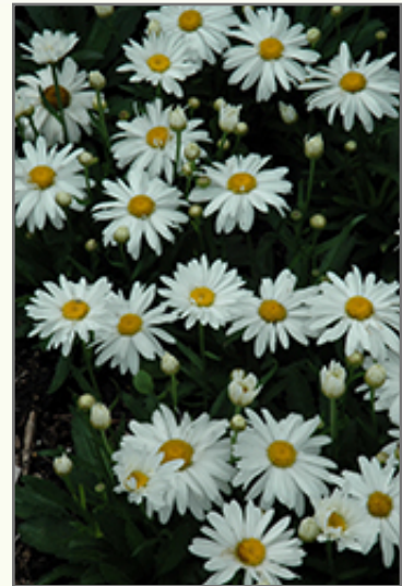
Whoops-A-Daisy Shasta Daisy flowers