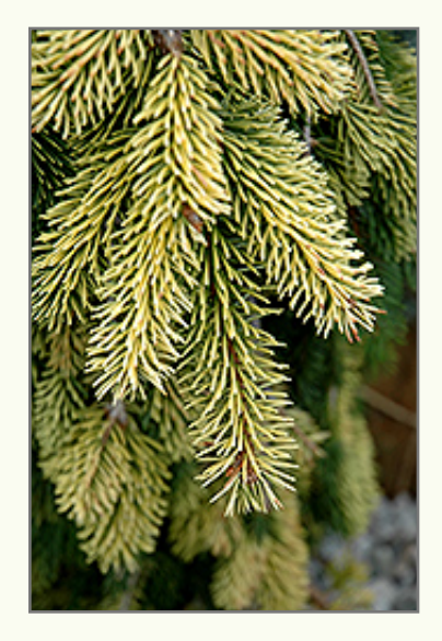
Gold Drift Norway Spruce foliage