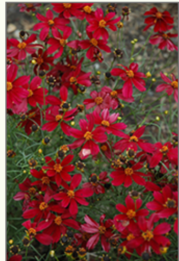
Red Satin Coreopsis in bloom