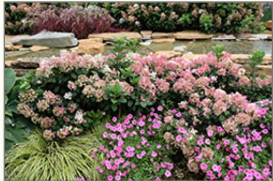
Little Quick Fire® Hydrangea in bloom