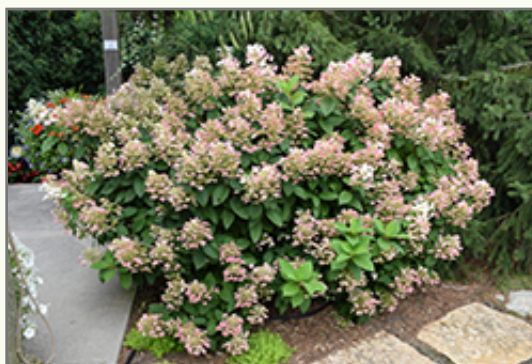
Little Quick Fire® Hydrangea in bloom