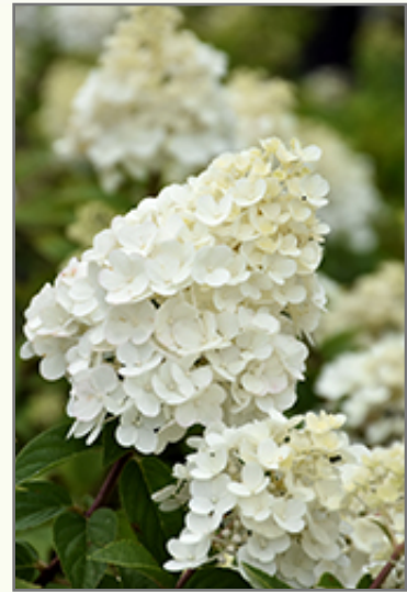
Strawberry Sundae Hydrangea flowers

#5 container-$46.99 Sizes and availability subject to change. Please contact the store for more information