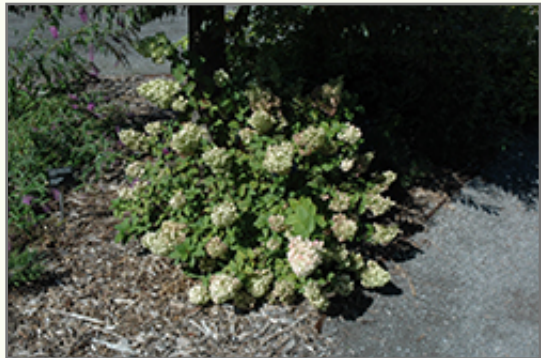
Strawberry Sundae Hydrangea in bloom