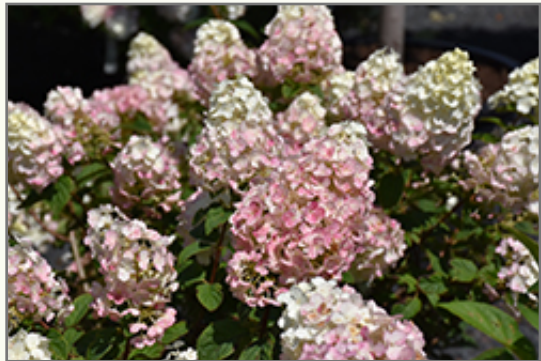
Strawberry Sundae Hydrangea flowers

Strawberry Sundae Hydrangea is recommended for the following landscape applications;