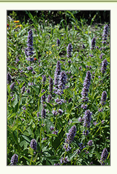
Lavender Hyssop flowers

Lavender Hyssop has masses of beautiful spikes of lightly-scented lavender flowers rising above the foliage from mid summer to mid fall, which are most effective when planted in groupings. The flowers are excellent for cutting. Its attractive fragrant pointy leaves remain dark green in color throughout the season.