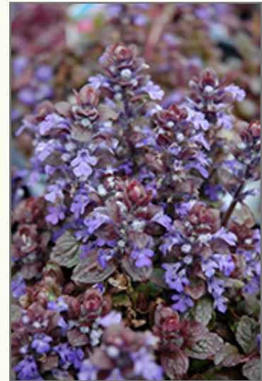
Bronze Beauty Ajuga flowers

Bronze Beauty Ajuga is recommended for the following landscape applications;