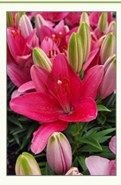
Tiny® Toons Asiatic Lily flowers

Height: 14 inches Spread: 12 inches Spacing: 10 inches Sunlight: ○ ● Hardiness Zone: 3a Group/Class: Dwarf Asiatic Description: