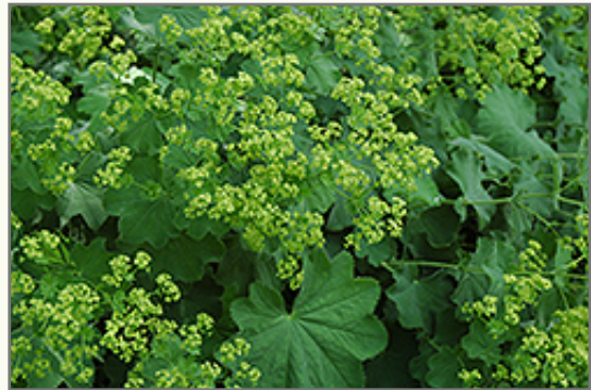
Lady's Mantle flowers

Lady's Mantle is recommended for the following landscape applications;