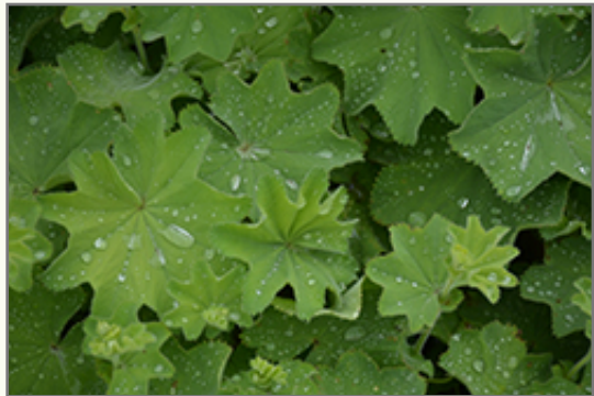
Lady's Mantle foliage