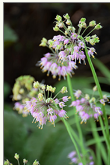
Nodding Pink Onion flowers