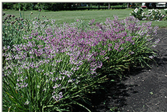
Nodding Pink Onion in bloom