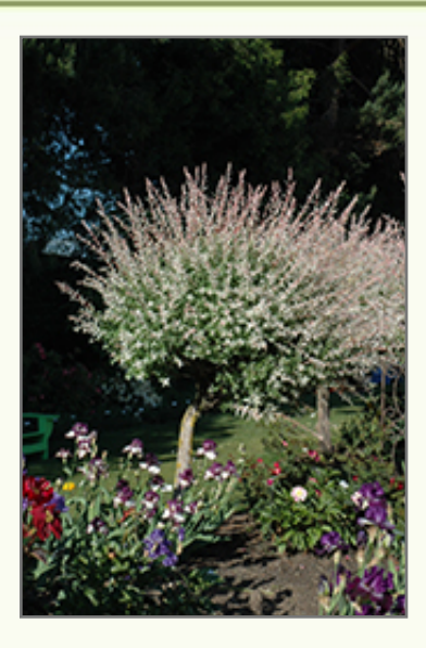
Hakura Nishiki Dappled Willow (tree form)

#15 container TF - $169.99 * Sizes and availability subject to change. Please contact store for more information