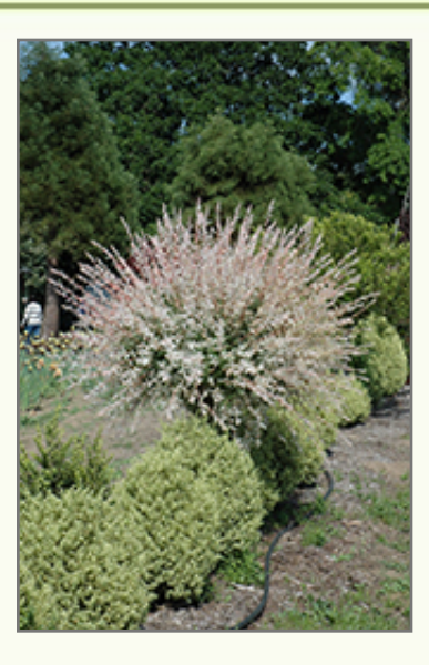
Hakura Nishiki Dappled Willow (tree form) in spring

This dwarf tree will require occasional maintenance and upkeep, and is best pruned in late winter once the threat of extreme cold has passed. It has no significant negative characteristics.