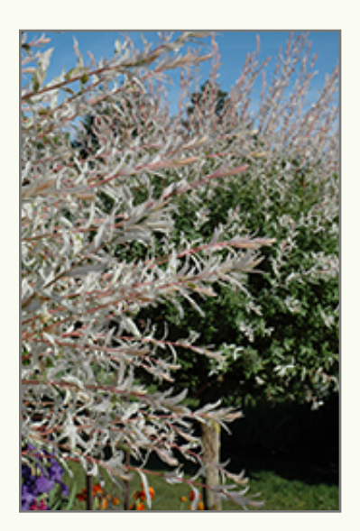
Hakura Nishiki Dappled Willow (tree form) foliage