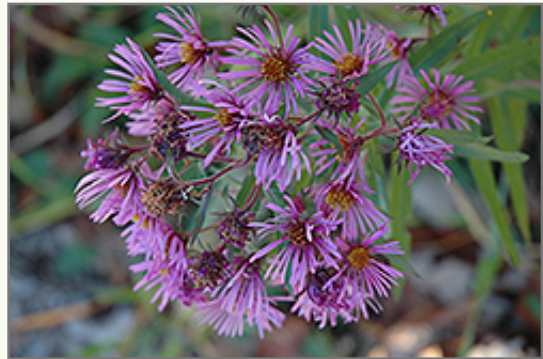
New England Aster flowers