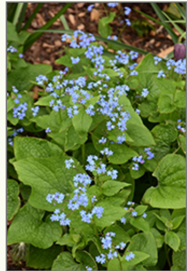
False Forget-Me-Not flowers