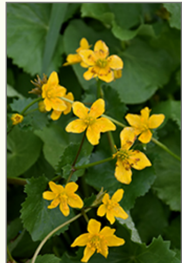
Marsh Marigold flowers