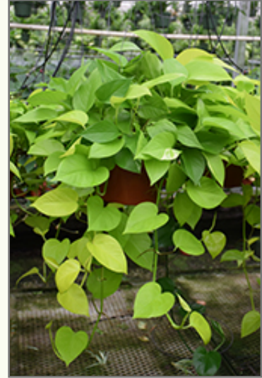
Neon Pothos in full

This is an herbaceous evergreen houseplant with a spreading, ground-hugging habit of growth. This plant can be pruned at any time to keep it looking its best.