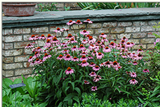
Magnus Coneflower in bloom