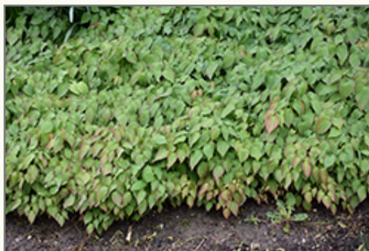
Red Epimedium