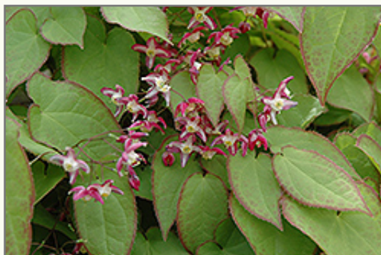
Red Epimedium flowers

Red Epimedium is a dense herbaceous evergreen perennial with a ground-hugging habit of growth. Its relatively fine texture sets it apart from other garden plants with less refined foliage.