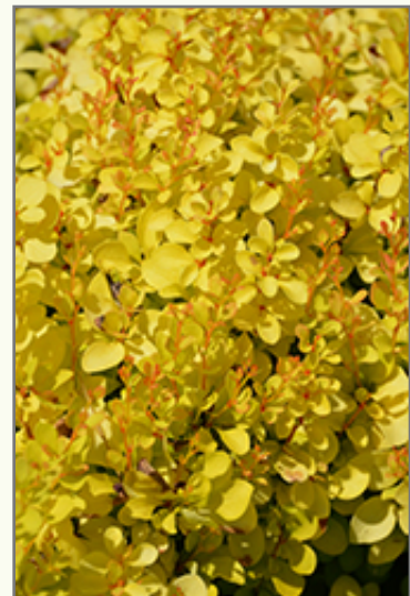
Sunjoy® Mini Saffron Barberry foliage