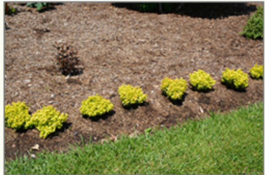
Sunjoy® Mini Saffron Barberrry (pruned as hedge)