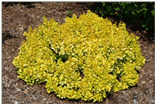
Sunjoy® Mini Saffron Barberry