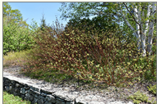
Bailey's Red Twig Dogwood in spring