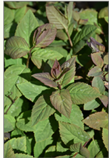
Double Play Blue Kazoo Spirea foliage