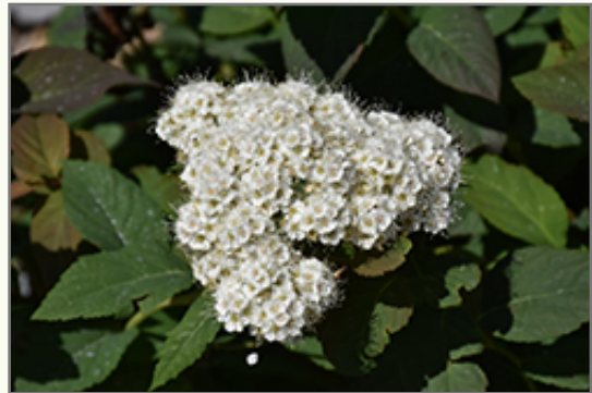
Double Play Blue Kazoo Spirea flowers

This shrub will require occasional maintenance and upkeep, and is best pruned in late winter once the threat of extreme cold has passed. It is a good choice for attracting butterflies to your yard, but is not particularly attractive to deer who tend to leave it alone in favor of tastier treats. It has no significant negative characteristics.