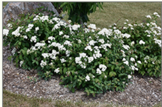
Double Play Blue Kazoo Spirea in bloom