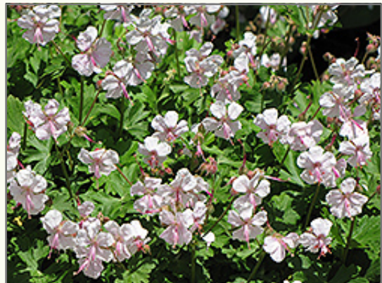
Biokovo Geranium in bloom