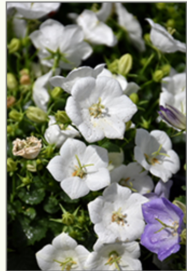
Rapido White Campanula flowers

Rapido White Campanula is recommended for the following landscape applications;