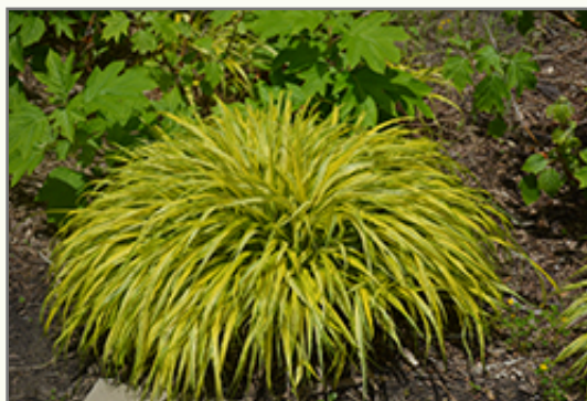
Golden Japanese Forest Grass