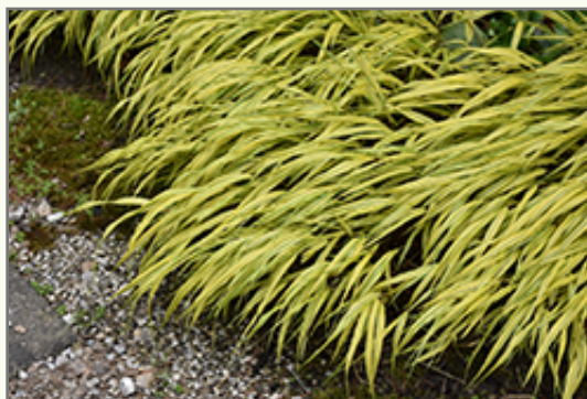
Golden Japanese Forest Grass