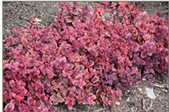
SunSparkler® Wildfire Sedum