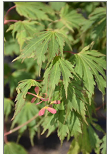
Northern Glow® Maple foliage