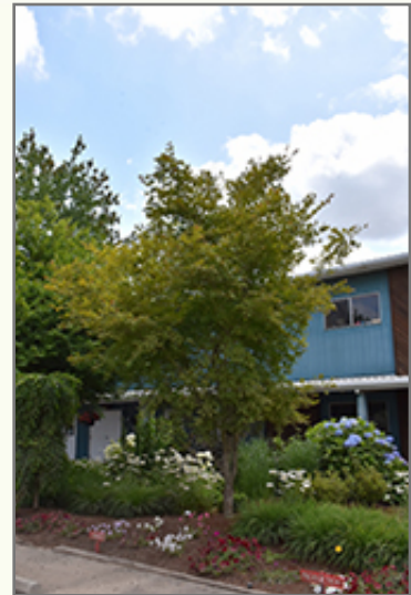
Northern Glow® Maple