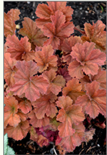
Northern Exposure Amber Coral Bells foliage

This is a relatively low maintenance plant, and should be cut back in late fall in preparation for winter. It is a good choice for attracting butterflies to your yard. It has no significant negative characteristics.