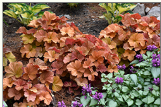
Northern Exposure Amber Coral Bells