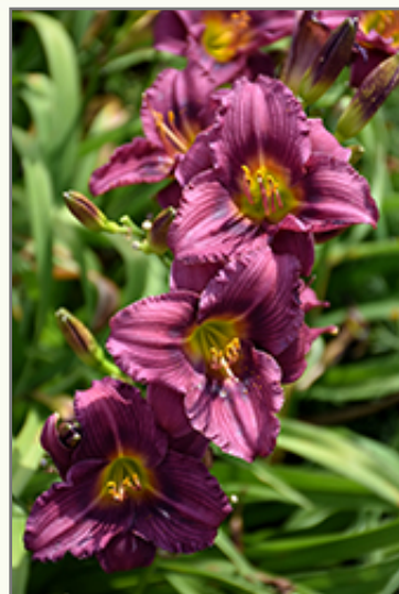
Little Grapette Daylily flowers