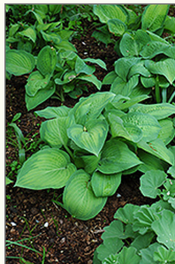
Paul's Glory Hosta