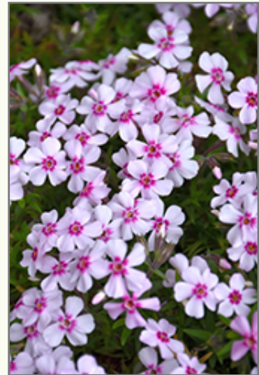
Coral Eye Creeping Phlox flowers

Coral Eye Creeping Phlox is a fine choice for the garden, but it is also a good selection for planting in outdoor pots and containers. Because of its spreading habit of growth, it is ideally suited for use as a 'spiller' in the 'spiller-thriller-filler' container combination; plant it near the edges where it can spill gracefully over the pot. Note that when growing plants in outdoor containers and baskets, they may require more frequent waterings than they would in the yard or garden. Be aware that in our climate, most plants cannot be expected to survive the winter if left in containers outdoors, and this plant is no exception. Contact our experts for more information on how to protect it over the winter months.