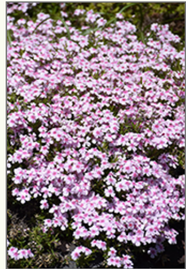
Coral Eye Creeping Phlox flowers

Coral Eye Creeping Phlox is a dense herbaceous evergreen perennial with a ground-hugging habit of growth. It brings an extremely fine and delicate texture to the garden composition and should be used to full effect.