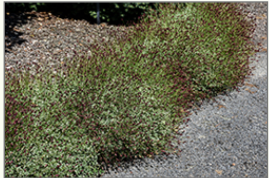
Little Angel Burnet in bloom

Little Angel Burnet is an open herbaceous perennial with a rigidly upright and towering form. It brings an extremely fine and delicate texture to the garden composition and should be used to full effect.