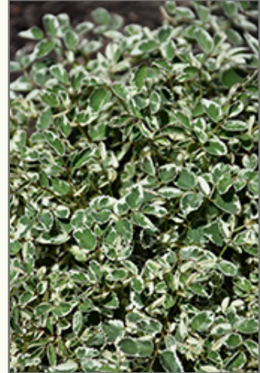
Little Angel Burnet flowers

This plant does best in full sun to partial shade. It prefers to grow in average to moist conditions, and shouldn't be allowed to dry out. It is not particular as to soil type or pH. It is somewhat tolerant of urban pollution. This is a selected variety of a species not originally from North America. It can be propagated by division; however, as a cultivated variety, be aware that it may be subject to certain restrictions or prohibitions on propagation.