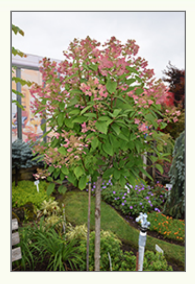
Quick Fire Hydrangea (tree form) (topiary form)