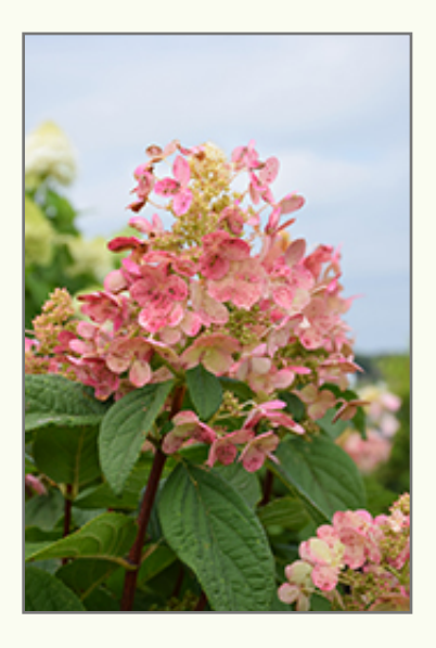
Quick Fire Hydrangea (tree form) flowers