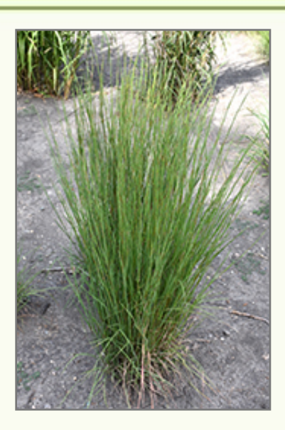
Blaze Little Bluestem

This selection is noted for its vivid fall foliage; pale blue new foliage matures to sea green; fall colors from pinkish orange to purple, to blazing red; burgundy seed heads turn silver in fall; perfect as a landscape accent, or along borders