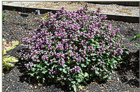
Beacon Silver Lamium in bloom