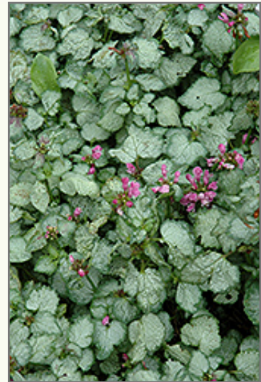
Beacon Silver Lamium flowers