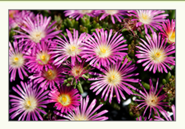
Delmara Pink Ice Plant flowers

Plant Height: 4 inches Flower Height: 6 inches Spread: 15 inches Spacing: 12 inches Sunlight: O Hardiness Zone: 5a Group/Class: Delmara™ Series