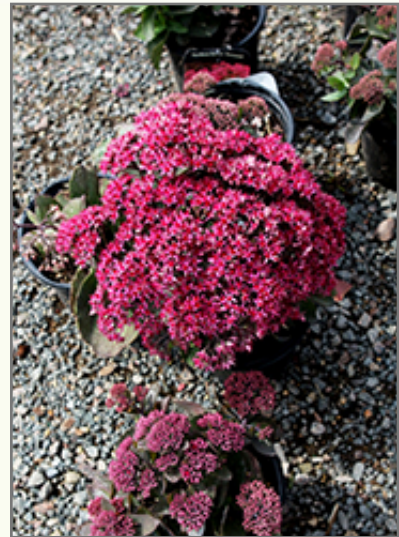
Dynomite Stonecrop in bloom

This is a relatively low maintenance plant, and is best cleaned up in early spring before it resumes active growth for the season. It is a good choice for attracting bees and butterflies to your yard, but is not particularly attractive to deer who tend to leave it alone in favor of tastier treats. It has no significant negative characteristics.