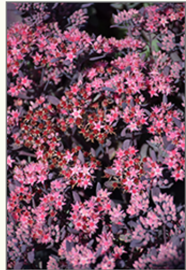
Plum Dazzled Stonecrop flowers

Plum Dazzled Stonecrop is covered in stunning panicles of pink flowers with rose eyes rising above the foliage from late summer to mid fall, which emerge from distinctive dark red flower buds. The flowers are excellent for cutting. Its attractive succulent round leaves emerge bluish-green in spring, turning plum purple in color throughout the season. The burgundy stems are very colorful and add to the overall interest of the plant.