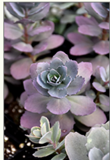
Plum Dazzled Stonecrop foliage