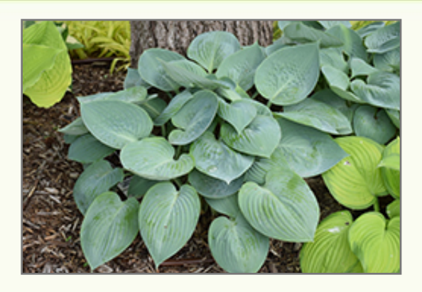
Prairie Sky Hosta

Prairie Sky Hosta is recommended for the following landscape applications;