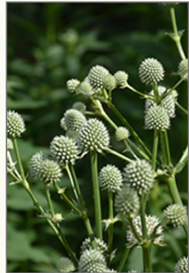
Rattlesnake Master flowers

Rattlesnake Master is an herbaceous perennial with a mounded form. Its relatively fine texture sets it apart from other garden plants with less refined foliage.