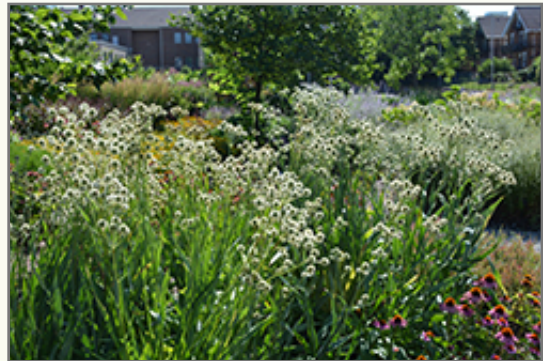
Rattlesnake Master in bloom