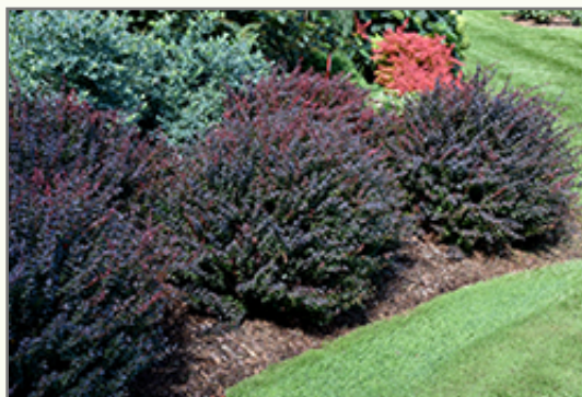
Sunjoy Mini Maroon Barberry