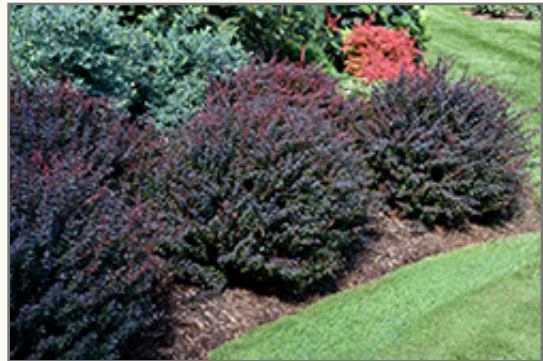
Sunjoy Mini Maroon Barberry