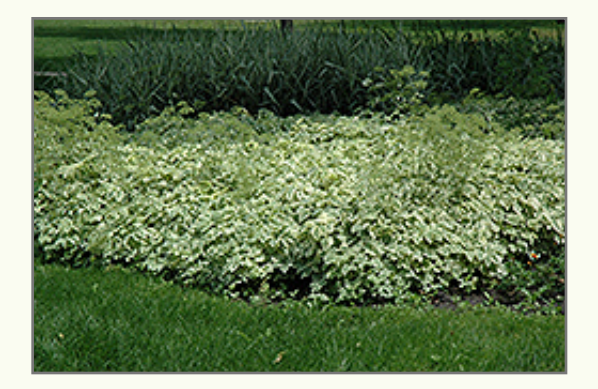
Snow on the Mountain

This is a high maintenance plant that will require regular care and upkeep, and can be pruned at anytime. Gardeners should be aware of the following characteristic(s) that may warrant special consideration;