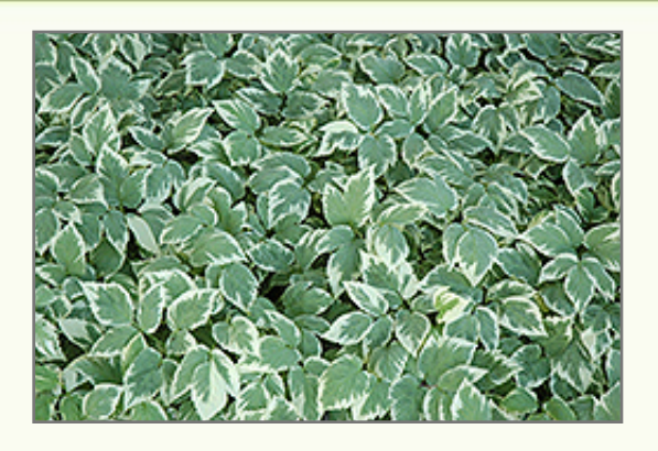
Snow on the Mountain foliage

Snow on the Mountain is an herbaceous perennial with a ground-hugging habit of growth. Its medium texture blends into the garden, but can always be balanced by a couple of finer or coarser plants for an effective composition.