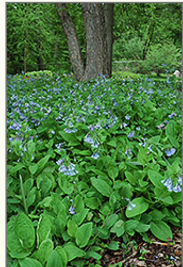
Virginia Bluebells in bloom