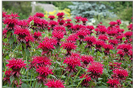
Raspberry Wine Beebalm flowers

This plant will require occasional maintenance and upkeep, and should be cut back in late fall in preparation for winter. It is a good choice for attracting bees, butterflies and hummingbirds to your yard, but is not particularly attractive to deer who tend to leave it alone in favor of tastier treats. Gardeners should be aware of the following characteristic(s) that may warrant special consideration;