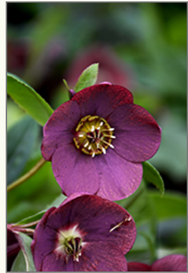
Honeymoon Rome In Red Hellebore flowers

This is a relatively low maintenance plant, and should be cut back in late fall in preparation for winter. Deer don't particularly care for this plant and will usually leave it alone in favor of tastier treats. It has no significant negative characteristics.