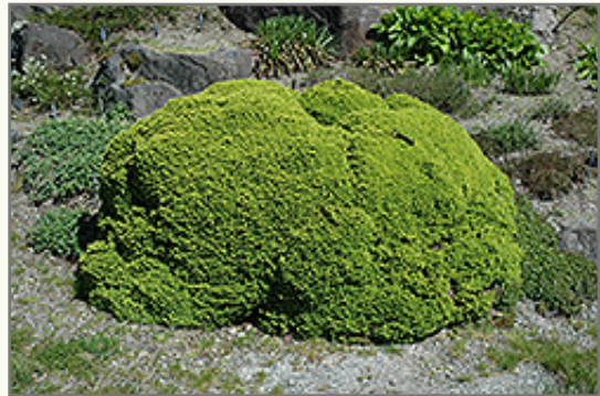
Little Gem Norway Spruce

This is a high maintenance shrub that will require regular care and upkeep. When pruning is necessary, it is recommended to only trim back the new growth of the current season, other than to remove any dieback. Deer don't particularly care for this plant and will usually leave it alone in favor of tastier treats. It has no significant negative characteristics.