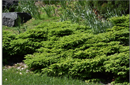
Little Gem Norway Spruce