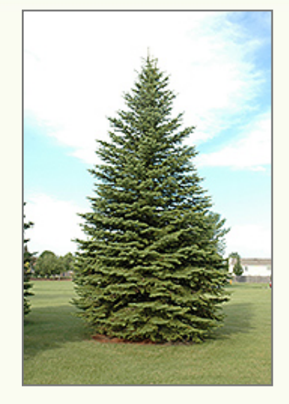
Colorado Spruce