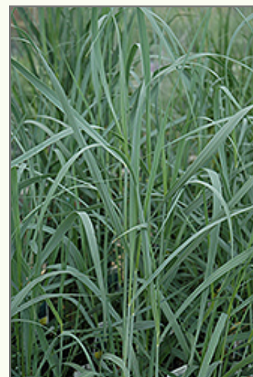
Heavy Metal Switch Grass foliage