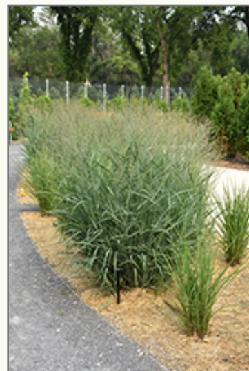
Heavy Metal Switch Grass