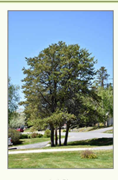
Jack Pine