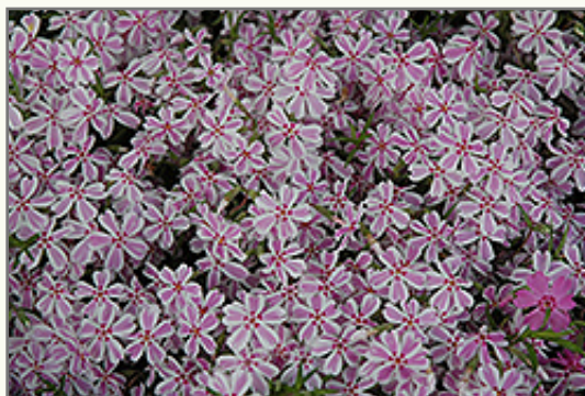
Candy Stripe Creeping Phlox flowers

Candy Stripe Creeping Phlox is recommended for the following landscape applications;